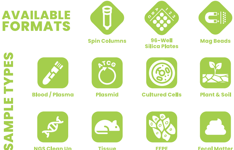
NGS Clean Up